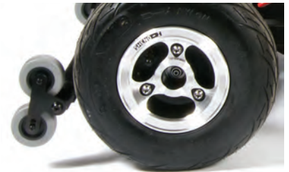
Quintell™ Kerbmaster™ Anti-tipping / Powered Anti-grounding

For Access Ramps see our 'RAMPS' brochure and price list