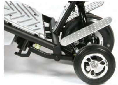
Quintell™ Adaptive Footplates Adjustable to match your measurements