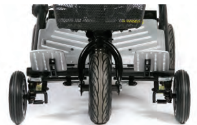
Quintell™ Solenoid Stabilising System Controls Active Tri-Wheel Steering

Please note: Images of Quingo Air are shown with optional 'Floor Mounted Lockable Storage Box' fitted