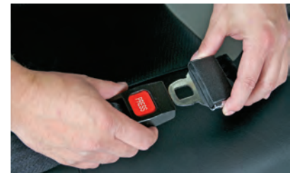
Quick release seat belt Adjustable to match your measurements